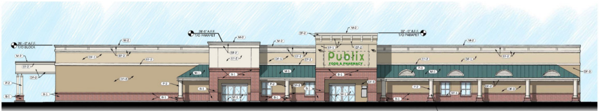
GROCERY STORE FRONT ELEVATION